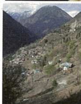
Earthquake-Proof Sustainable Housing Bagh and Jareed, Pakistan submitted by Article 25