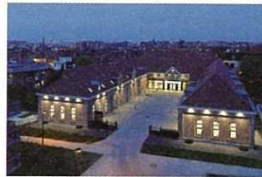
Les Ecuries de la Chasse Royale Brussels, Belgium Architect: ASSAR Architects Developer: Royal Hunt Properties