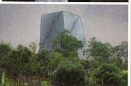
Centre for Sustainable Energy Technologies, CSET Ningbo, China Architect: Mario Cucinella Architects Construction Management: Wanli Education Group, Zhejiang Province Developer: Nottingham University UK and Nottingham University Ningbo