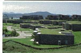
Phoenix Island Villa Condo & Club H Seogwipo-si, Republic of South Kor Architect: Samoo Architects and Engineers Club House Design Architect: Mario Botta Architeto Developer: Bokwang Jeju