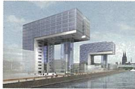
Kranhaus1 Cologne, Germany Architect: Bothe Richter Teherani Architects BDA, Hamburg / Linster Architects, Trier-Aachen-Luxembourg Developer: Development Partner AG