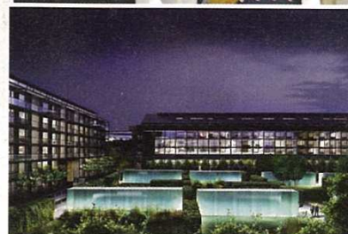
Highbury Square London, United Kingdom Architect: Allies and Moore Architects Developer: Vision Four Developments Planning Consultants: Savills Property Agents: Savills